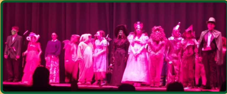
West Forest ↘