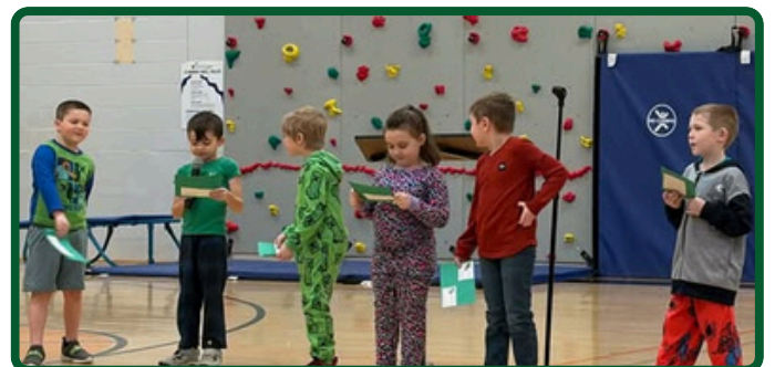
(Dad jokes pictured)